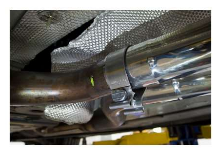
8. Align and slip URUTU X-Pipe onto rear factory tubing.